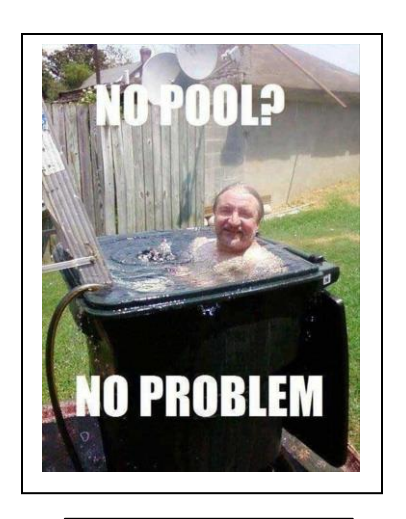
No Pool? No Problem!