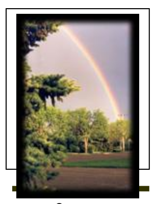
See us at: www.townofcupar.com